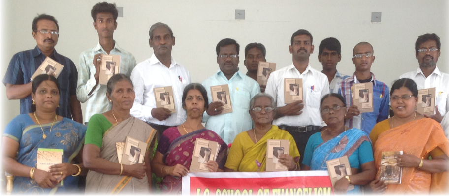
Students of the Bible in India