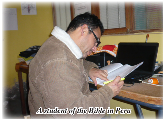
A student of the Bible in Peru

From its beginning, TFTWMS has especially sought to encourage indigenous works and churches. This approach to evangelism appears to be the closest approach to the New Testament pattern for evangelism and edification. Our goal is to assist the national preacher or teacher to be self-supporting, regardless of where he lives. This online school, when finally in place, is intended to be self-supporting.