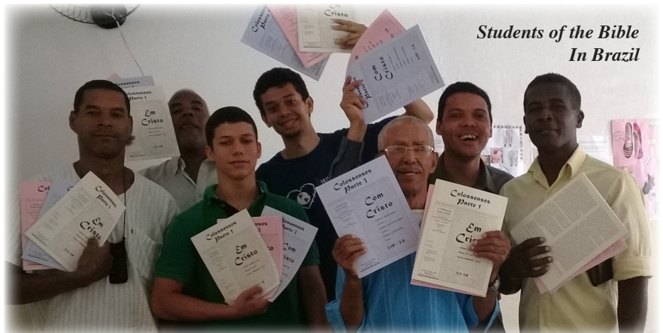
Students of the Bible In Brazil

This school must be given to the world! People throughout the world are hungry for the true Word of God. They are waiting, and they believe that those who have been blessed with knowledge of the Bible will make sure they get their opportunity. Our time to serve the world has come. Let us take it!