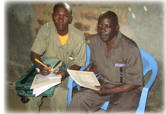
Students of God's Word in Kenya