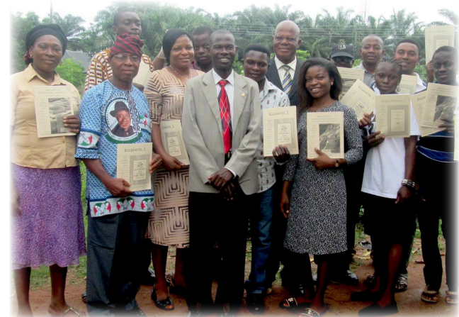
A congregation of the Lord's church in Nigeria