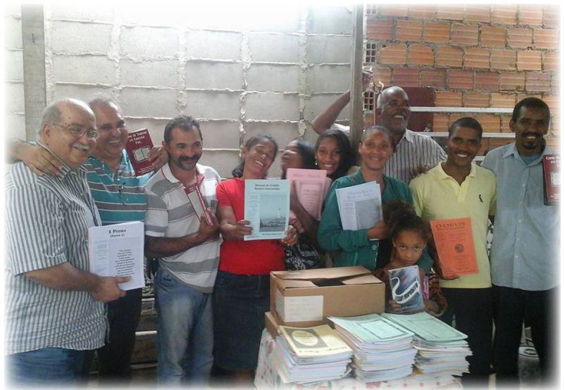
Truth for Today Recipients in Brazil

Setting up a gift annuity to allow funding for this work is another way to help. An amount set aside will produce interest payments throughout the donor's lifetime, while at the same time supplying funds for making these studies available to 65 to 70 percent of the population of the world.