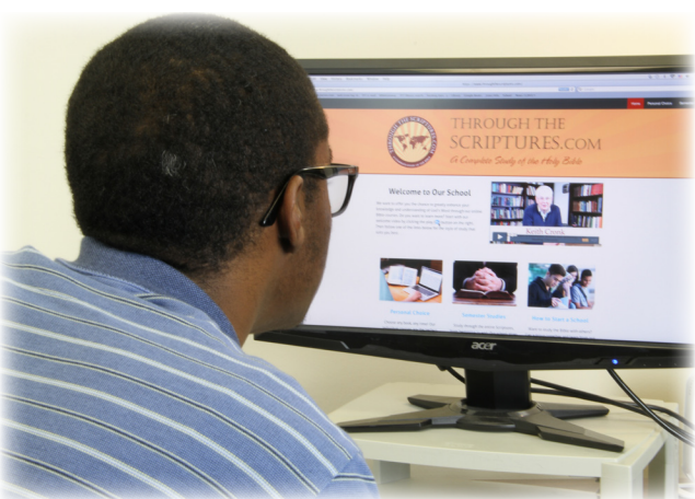
A user-friendly site