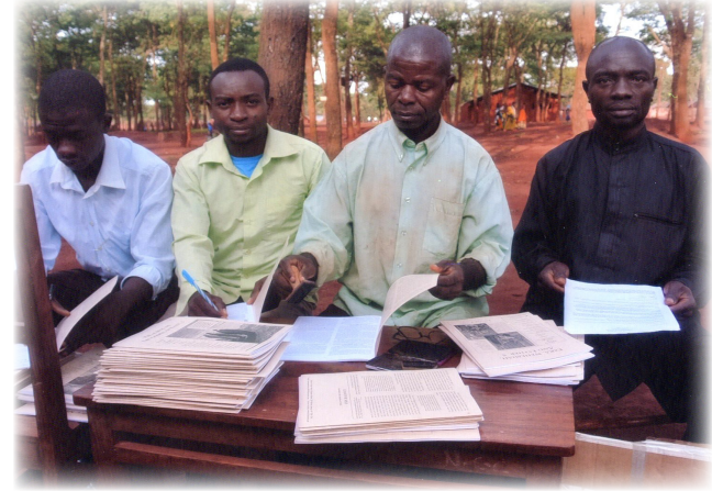
Bible students in Tanzania

Over a period of time, TFTWMS materials have covered almost the entire Bible. In most cases, the studies have been thorough, verse-by-verse coverage. On occasion, selected topics in the Scriptures have been sent. These materials have been written over the years by some of our finest scholars, those who are known for their responsible handling of the Scriptures. Besides providing spiritual growth, the mailings assist the nationals in their application of the Great Commission. Care is taken to ensure that each book includes the plan of salvation and a lesson containing the Restoration plea.