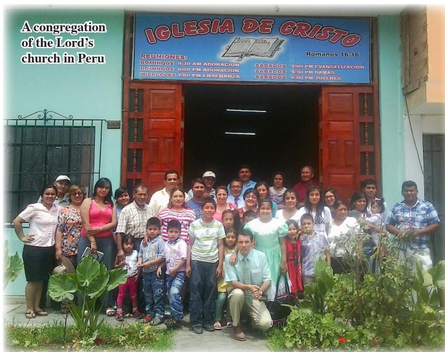
A congregation of the Lord's church in Peru

One of the important side benefits of the school is its follow-up ability. It will be a significant way to assist