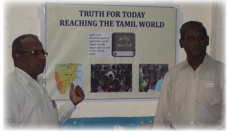
Workshop Displays Provided Additional Instruction

The workshop's theme was "Embracing the Dream," which grew out of the ambition to take the gospel message into every part of the nation of India. TFTWMS plans to add more languages to the seven that are presently being utilized in the printing of biblical literature for India.